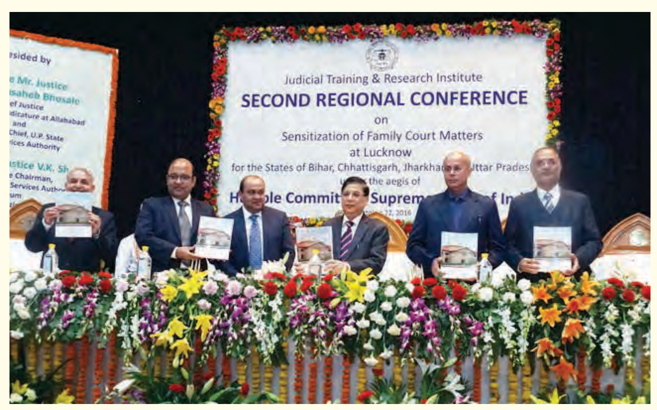
Release of Handbook