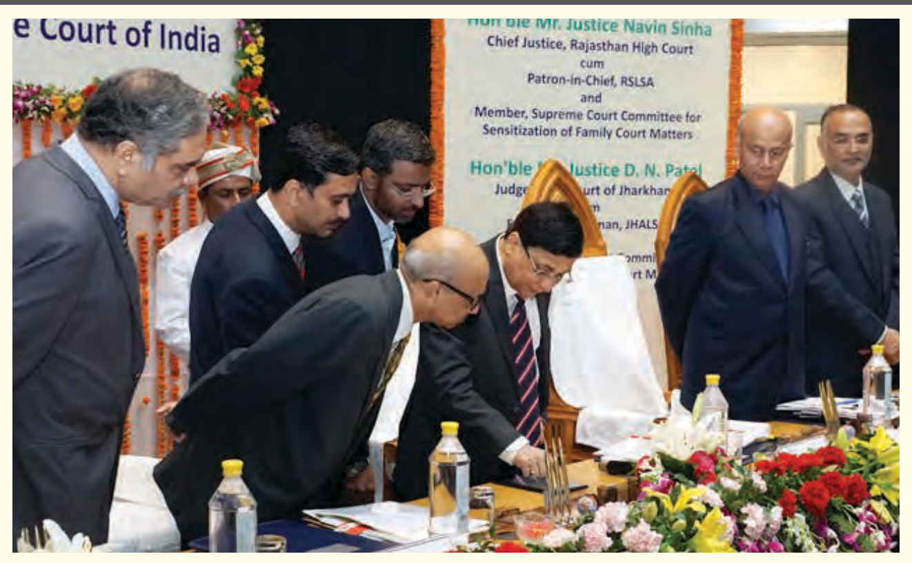
Hon'ble Mr. Justice Dipak Misra, Judge, Supreme Court of India and Chairman, Supreme Court Committee for Sensitization of Family Court Matters launching the mobile app developed by Allahabad High Court