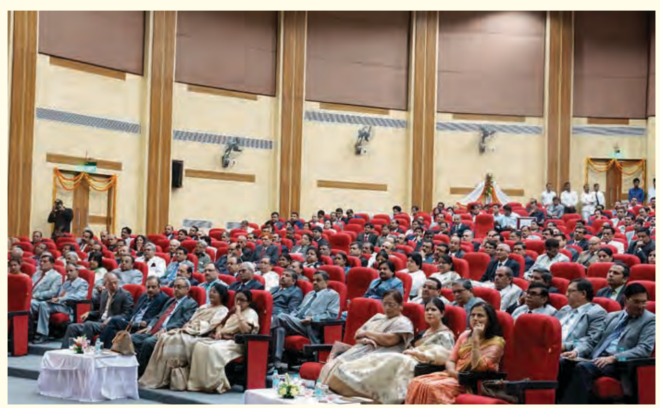
Hon'ble Judges of the Allahabad High Court, Patna High Court, Chhattisgarh High Court, Jharkhand High Court, Family Court Judges of Participating States: Uttar Pradesh, Bihar, Chhattisgarh, Jharkhand & Hon'ble Dignitaries attending the conference.