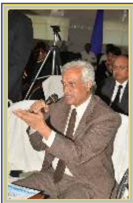
Hon'ble Mr. Justice P.P. Bhatt, Judge, High Court of Jharkhand interacting during the First Technical Session