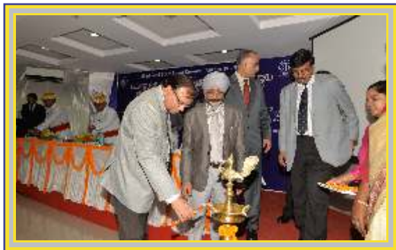
The Chief Guest Hon'ble Mr. Justice M.Y. Eqbal, Judge, Supreme Court of India Inaugurating the Programme by lighting of lamp