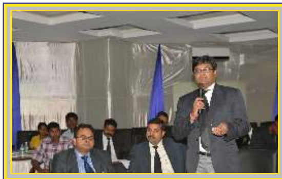
Participants during the Second Technical Session