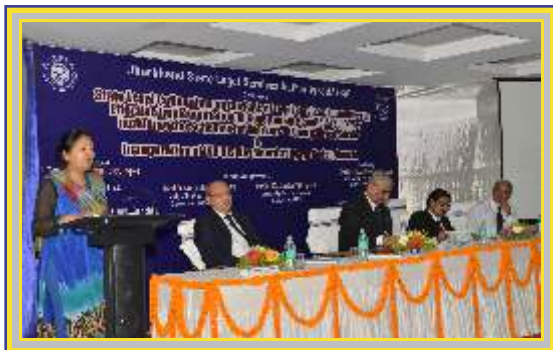
Dignitaries & Resource Persons at the Dais

In the 2 nd Technical Session the topic for discussion was Jharkhand Victim Compensation Scheme and lively discussion took place in which need for guidelines was felt in regard to enquiry & quantum of compensation.