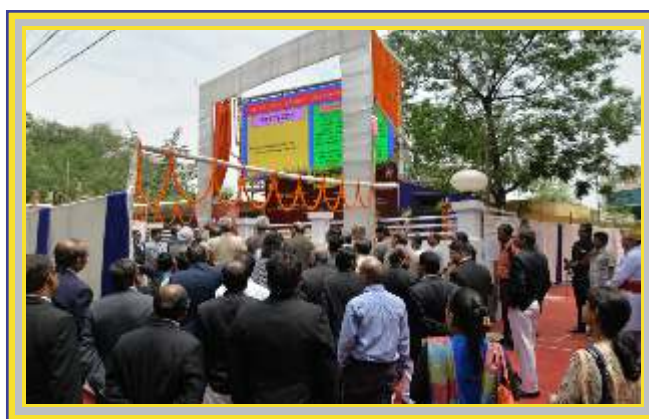
Gathering at LED Display Board at NYAYA SADAN, JHALSA