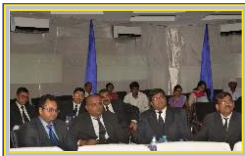
Participants during the First Technical Session