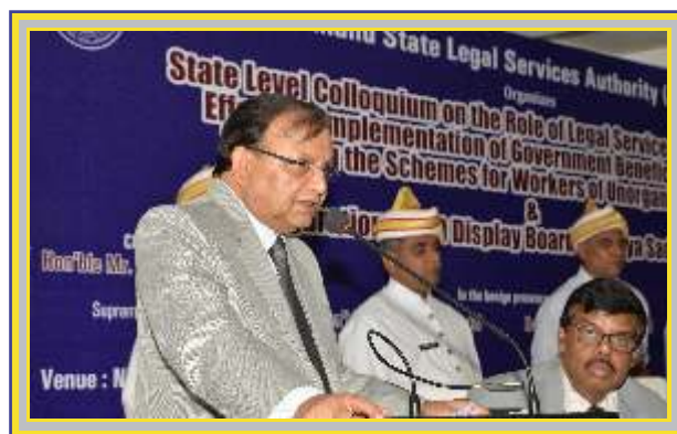
Hon'ble Mr. Justice M.Y. Eqbal, Judge, Supreme Court of India addressing the participants.