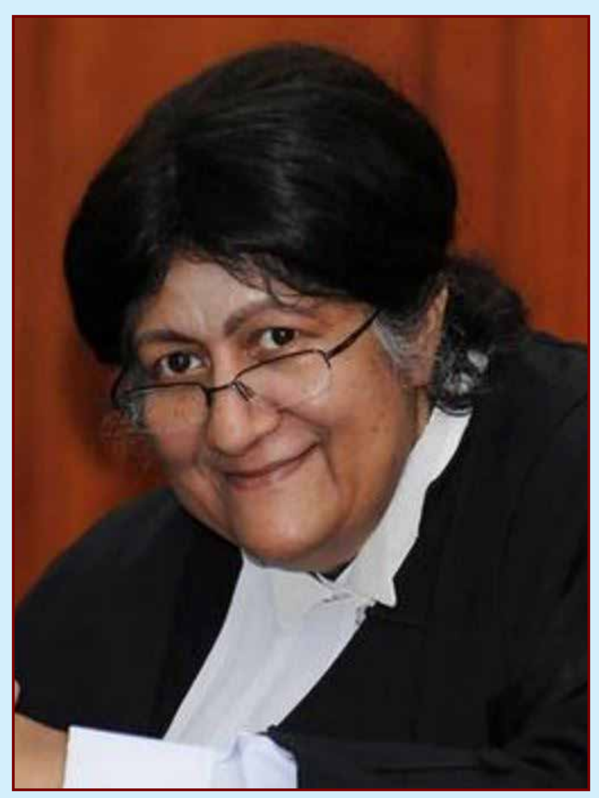
HON'BLE MS. JUSTICE INDIRA BANERJEE Judge, Supreme Court of India

& Member, Supreme Court Committee for Sensitization of Family Court Matters