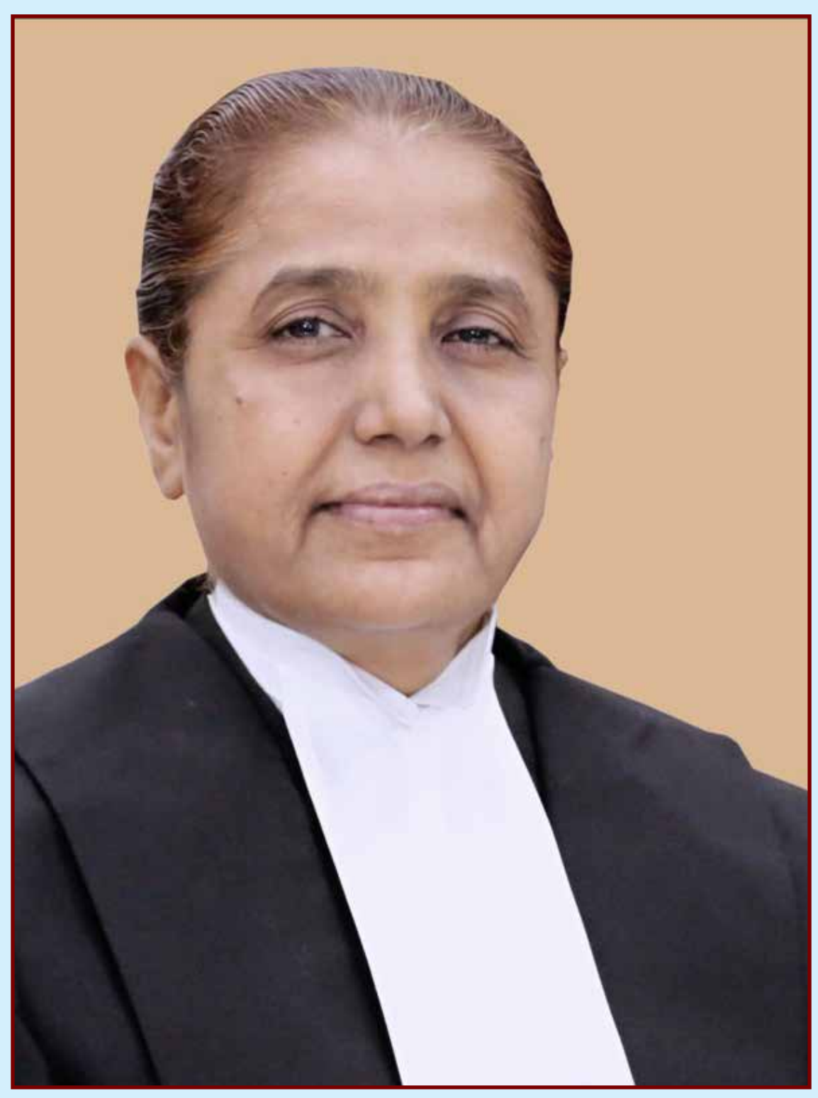
HON'BLE MRS. JUSTICE R. BANUMATHI Judge, Supreme Court of India

Chairperson, Supreme Court Committee for Sensitization of Family Court Matters