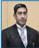
Hon'ble Mr. Justice Shree Chandrashekhar Judge, High Court of Jharkhand & Member, Mediation Monitoring Committee

Chief Justice, High Court of Jharkhand cum Patron-in-Chief, JHALSA