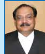
Hon'ble Mr. Justice Amitav Gupta Judge, High Court of Jharkhand & Member, Mediation Monitoring Committee

Under the guidance, control and aegis of Jharkhand High Court Mediation Monitoring Committee, JHALSA has taken up a number of steps to strengthen the Mediation viz :